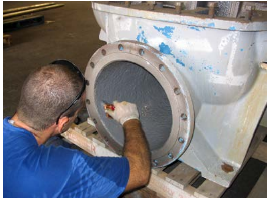
Corr-Paint™ CP2060 coats pump housing.