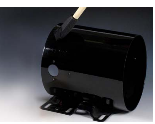
Corr-Paint™ CP2000 coats motor housing.