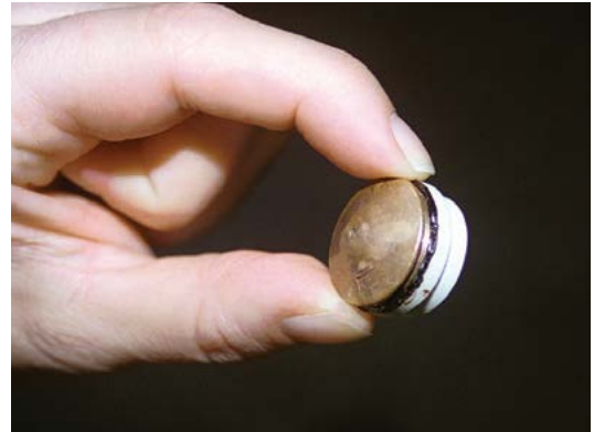
Aremco-Bond™ 570 bonds ceramic to copper nozzle.