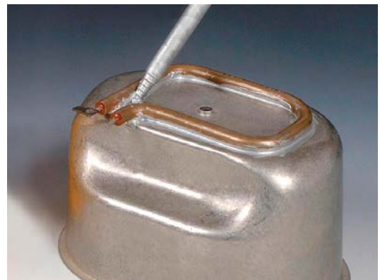
Aremco-Bond™ 568 bonds copper coil.