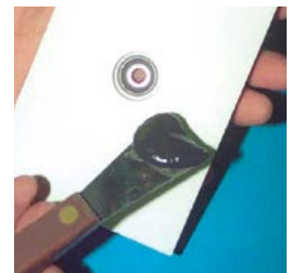
Aremco-Bond™ 2150 bonds ceramic wear tile.