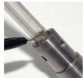
Aremco-Bond™ 631 bonds sapphire tube to stainless steel.